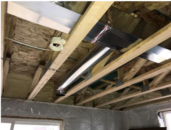
9. Ducted and sealed supply air