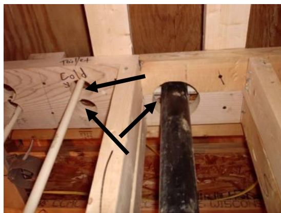
4. Seal all penetrations through the top sill plate on walls. (missing in photo)