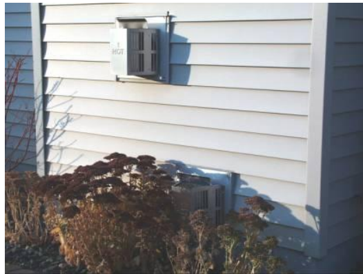
2. Fireplace vent 12 inches from grade. (see manufactures specs for other)