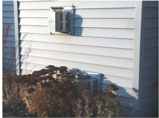
2. Fireplace vent 12 inches from grade. (see manufactures specs for other)