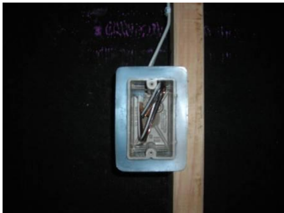
3. Sealed boxes required in exterior walls where insulated with fiberglass.