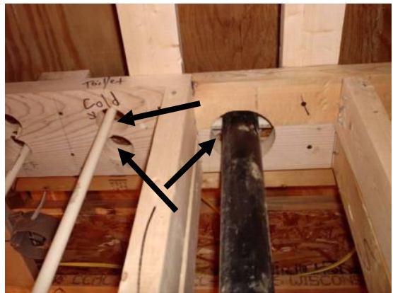
4. Seal all penetrations through the top sill plate on walls. (missing in photo)