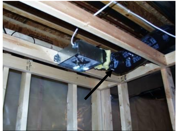
8. Insulated flex duct from bath fan leading to exterior, minimum 3 feet from exterior wall in required to be insulated.