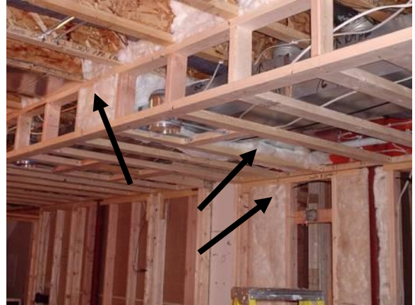
6. Fiberglass insulation used as fire-blocking every 10 feet horizontally in the soffit and separating soffit from wall cavity.