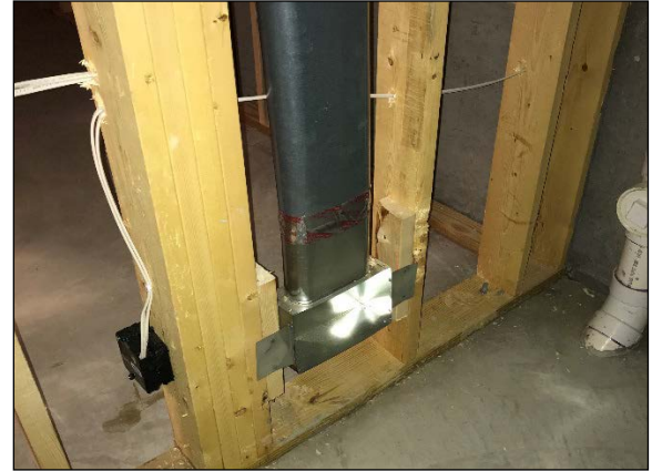
10. Ducted and sealed return air.