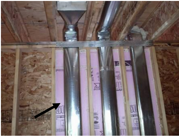
7. 1 ½ rigid foam insulation used behind heat runs in exterior walls.