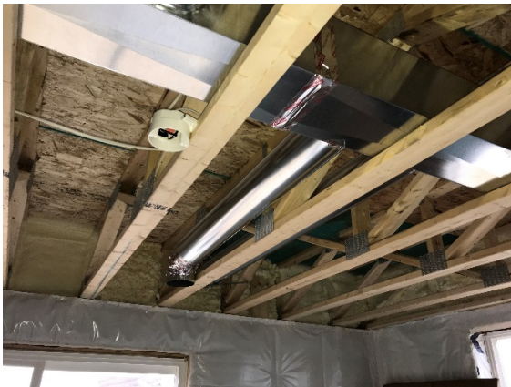
9. Ducted and sealed supply air