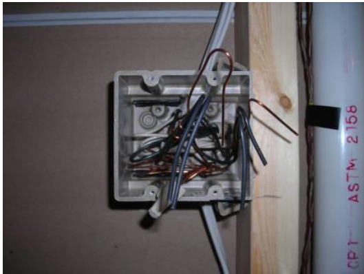
1. Electrical rough-in have all boxes made up and ready with minimum 6-inch tails.