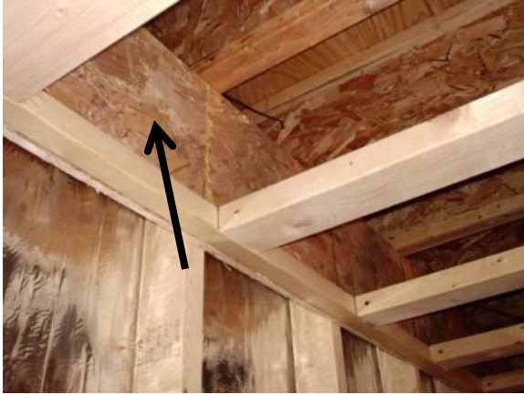
5. Plywood used as fire-blocking from the soffit to the wall cavities.